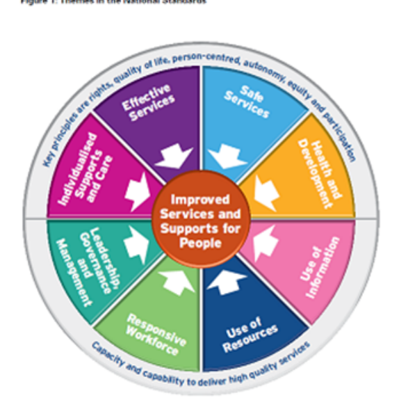
Figure 1: Themes in the national standards

Each section is made up of four themes which are set out in full in the national standards for residential services for children and adults with disabilities which are available on our website, <a href="https://www.hiqa.ie">www.hiqa.ie</a>. The standards are then written against each theme.