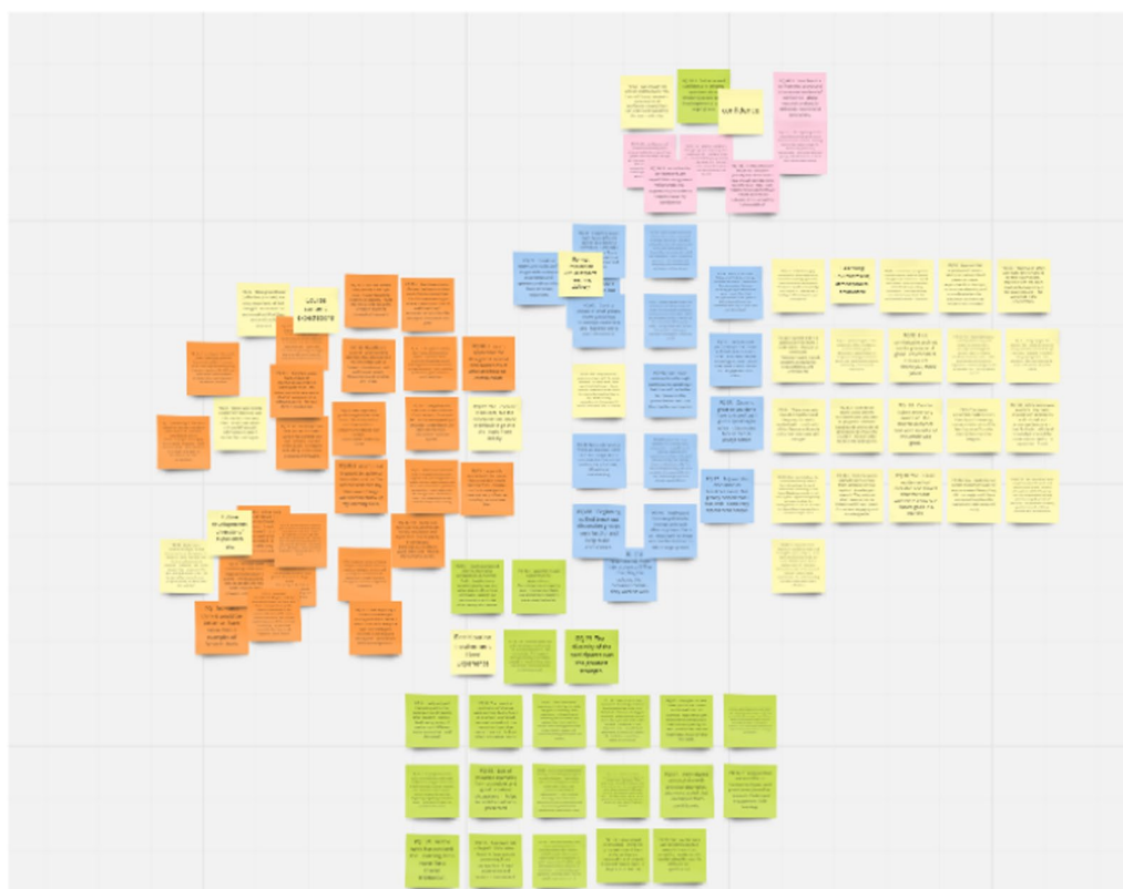
Fig. 4 Miro board post co-research group discussion

commencement of the course, all registered participants were invited to be involved in the research study and informed that participation would be voluntary and non-obligatory to attending the course. Thirty participants consented to participate in the evaluation of the course including Statutory Sector Professionals (n=13), C&V Sector Professionals (n=6), those with lived experience of health and social care (n=7) and carers with lived experience (n=4). Age ranges varied from 19 to 73 years old. Participants were predominately female (n=24), five males participated (n=5) and there was one participant who identified as non-binary (n=1). In regard to academic background, nine participants had completed postgraduate degrees (n=9), fourteen participants had completed an undergraduate degree (n=14), three participants stated their academic background was diploma level (n=2), two participants stated GCSEs (n=2) and two participants stated that they are currently completing an undergraduate degree (n=2). Twenty-one (n=21) participants responded to the post-course survey. Two participants dropped out of the course stating the reason of unprecedented work commitments.