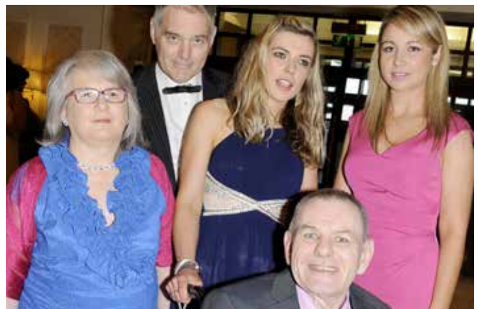
Staff and Service Users attending the Winter Ball in Trim