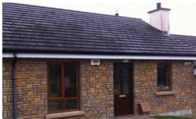
The new Praxis Care service which opened in Carrickmacross this year

The Castleross scheme is a new service in Carrickmacross, providing care and support to people with mental ill health and complex needs. The building is owned by Tuath Housing Association, and it is hoped that the service will expand in the near future.