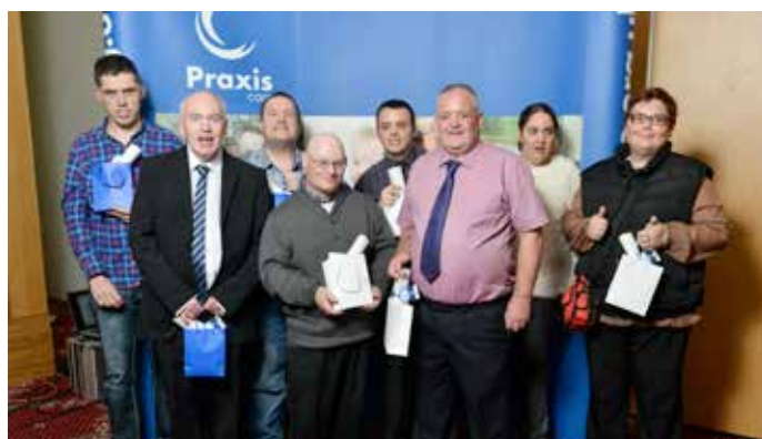
Moving Up Programme trainees with their certificates and awards

36 trainees achieved an NOCN Progression Award and 24 trainees achieved NOCN unit accreditations in a range of NOCN courses. The trainees involved with the Programme were also nominated for a number of special awards which were also presented at the event.