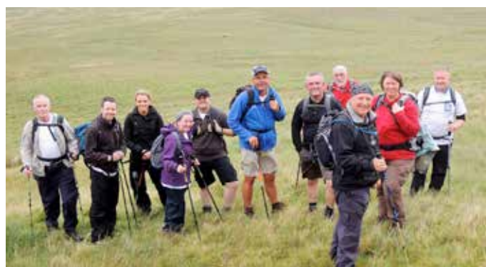
Staff and volunteers on the slopes of Mweelrea in County Mayo during the Three Peak Challenge

Eleven volunteers literally 'rose to the challenge' by climbing three of the highest peaks in Ireland to fundraise for Praxis Care services. Over the space of an action-packed weekend, the brave volunteers scaled Lugnaquilla, the highest mountain in Co Wicklow, Mweelrea, the highest in Co Mayo, and Carruntoohil, Co Kerry, the highest mountain in Ireland. Between them the group raised nearly £8000 to improve the lives of Praxis Care service users.