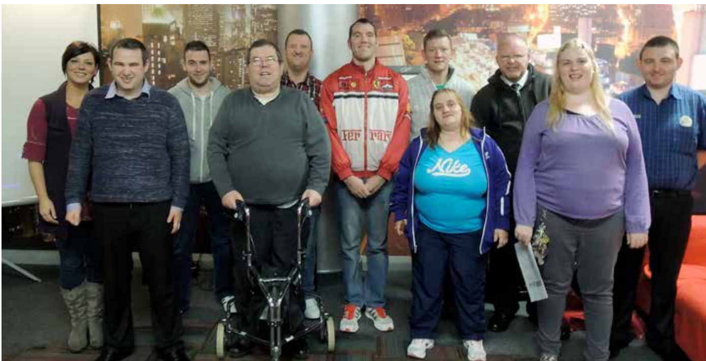
Service users and staff members attending an UP in Policy Group meeting during the year

The PALS Group is another group of service users who work closely with the Staff Development Department to develop and deliver effective, service user and values focused training to Praxis Care staff. Members of the group talk to new staff members as part of the induction to give them an idea of what it will be like to work for the organisation. They not only help improve services, but also help staff reflect on how their work and support make a difference in the lives of all service users.