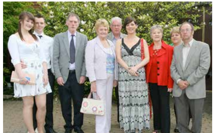
Volunteers and staff from the Secret Garden in Hillsborough at the Volunteer Awards.