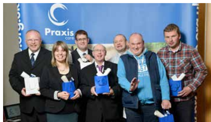
Trainees from the Moving Up Programme with their certificates and awards