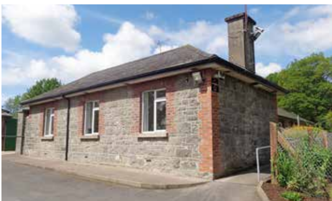
Holly Lodge in Monaghan, the new service commenced by Praxis Care in the grounds of St Davnet's Hospital

A new service also commenced in Monaghan, with the opening of Holly Lodge cottage, in the grounds of St Davnet's Hospital. The cottage provides accommodation for three individuals with intellectual disabilities.