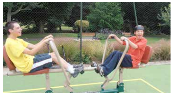
Play equipment is used to promote healthy lifestyles with the children in the Melton Children's Respite Service