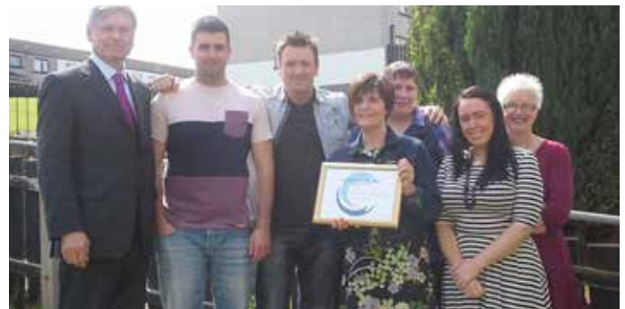
The staff team in Antrim were winners of the Team Work Award