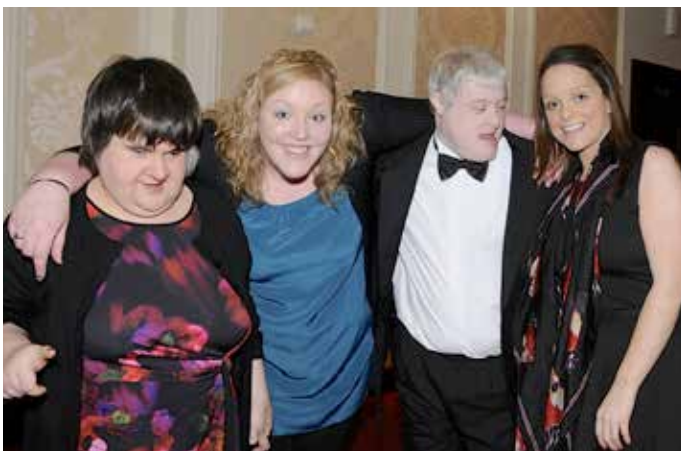
Staff and Service Users enjoying the Winter Ball in Trim

There was an orchestral music reception from 4pm, followed by a four course meal in the Knightsbrook Hotel. After the meal there was a raffle sponsored by local businesses and nearly every service user won something! Following this, a band played live music until the early hours. The event was a great success and enjoyed by all the service users who attended.