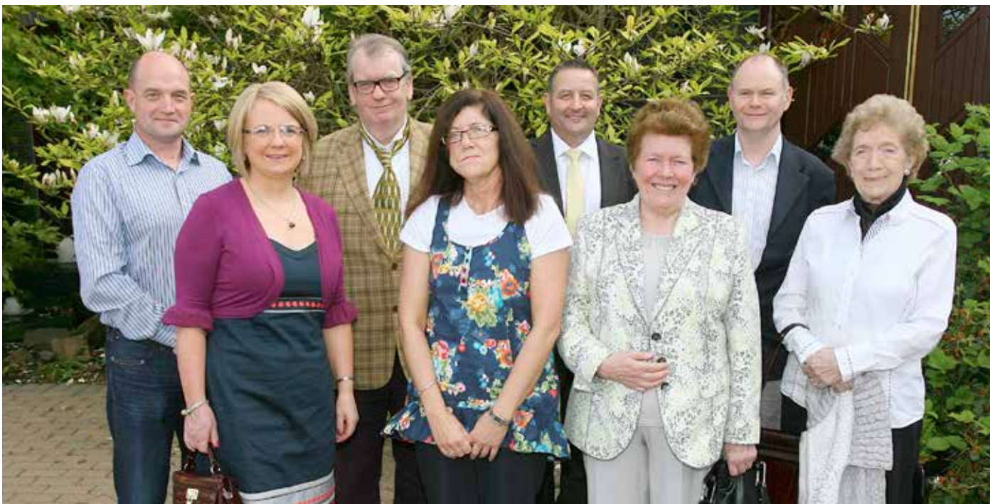
Volunteers, service users and staff from the Magherafelt scheme attending the Volunteer Awards event in the Templeton Hotel, Templepatrick