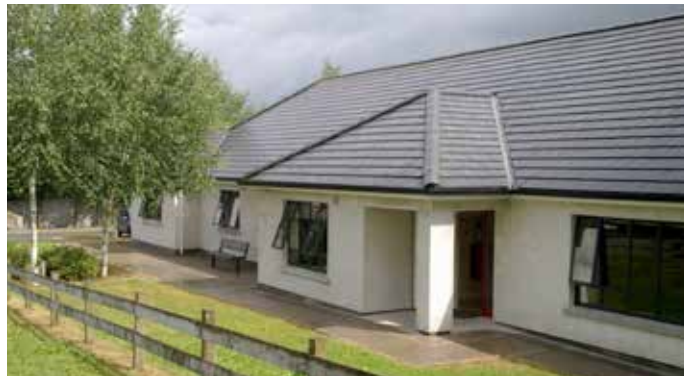
Iona House is the new service opened by Praxis Care in Castleblayney

While still in its infancy, there is great excitement within the scheme that staff will assist service users to be active members of the local community in Castleblayney and enjoy everyday living as part of the local community.